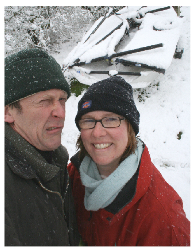
IT'S APRIL 6TH....

Arrangements are well under way - the Tassie association have secured the university accommodation nearby, and have a terrific arrangement with Toll for reasonable freight across the